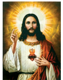
The Heart of Recovery