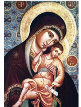
Our Lady of Recovery

Protect me, O Holy Spirit, that I may always seek through Your inspiration the path of recovery. Amen.