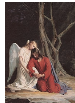
Guardian of Recovery

Angel of God, my Guardian dear, to whom His love commits me here, ever this day be at my side to light and guard, to rule and guide. Fold thy wings round me and guard my recovery from the effects of sin in my life. My defender and my patron, defend me against the enemies of my recovery who prowl around seeking the ruin of my soul. In acknowledgment and return for your loving ministry to me, I offer you the infinitely noble heart of Jesus, and firmly resolve to obey your inspirations to most faithfully serve Jesus, my Lord and God. Amen.