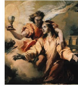
The Chalice of Recovery

O God, my Father, to You I raise the Chalice of salvation, that the effects of sin in my life may be washed away by the Blood of Your only begotten Son, Jesus. I long to be a vessel emptied of self. Accept, O Lord, my emptiness, and so fill me with Your Light, Your Love, and Your way of Life that these precious gifts may over-flow the chalice of my heart and radiate into the hearts of all with whom I come in contact this day, revealing to them the grace of Your joy and the serenity of Your peace which nothing can destroy. I offer this prayer through Your Son, our Lord, Jesus Christ, who lives and reigns with You in the unity of the Holy Spirit, one God forever and ever. Amen.