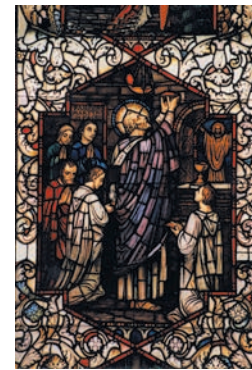
Recovery Prayer After Communion

I thank You, Father, Everlasting God, for having been pleased, through no merit of mine, but of Your great mercy alone, to feed me, a sinner, and Your unworthy servant, with the precious Body and Blood of Your Son, our Lord Jesus Christ. I pray that this Holy Communion may not be for my judgment and condemnation, but for my pardon and salvation. Let this Holy Communion be to me an armor of faith and a shield of good will, a cleansing of all the effects of sin in my life, and a rooting out of all evil desires. May it assist me in my recovery and be a firm defense against the evil designs of all my visible and invisible enemies, a perfect quieting of all the desires of soul and body. I pray that You bring me, a sinner, to the indescribable Feast where You, with Your Son and the Holy Spirit, are to Your saints true light, full blessedness, everlasting joy, and perfect happiness. Through the same Christ our Lord. Amen.