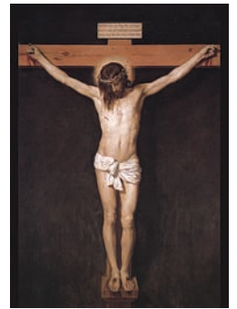
The Cross of Recovery