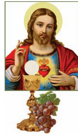
Recovery Prayer Before Communion

Almighty and Eternal God, behold I come to the sacrament of Your only-begotten Son, our Lord Jesus Christ. As one sick I come to the Physician of life; unclean, to the Fountain of mercy; blind, to the Light of eternal splendor; poor and needy to the Lord of heaven and earth. Therefore, I beg of You, through Your infinite mercy and generosity, strengthen my recovery from the effects of sin in my life by healing my weakness, washing away my uncleanness, giving light to my blindness, enriching my poverty, and clothing my nakedness. May I thus receive the Bread of Angels, the King of Kings, the Lord of Lords, with such reverence and humility, contrition and devotion, purity and faith, purpose and intention, as shall aid my soul's salvation. I pray this, as all things, through our Lord, Jesus Christ, who lives and reigns with You in the unity of the Holy Spirit, one God forever and ever. Amen.