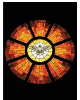
The Spirit of Recovery